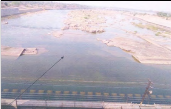
Damaged Portion of End Sill