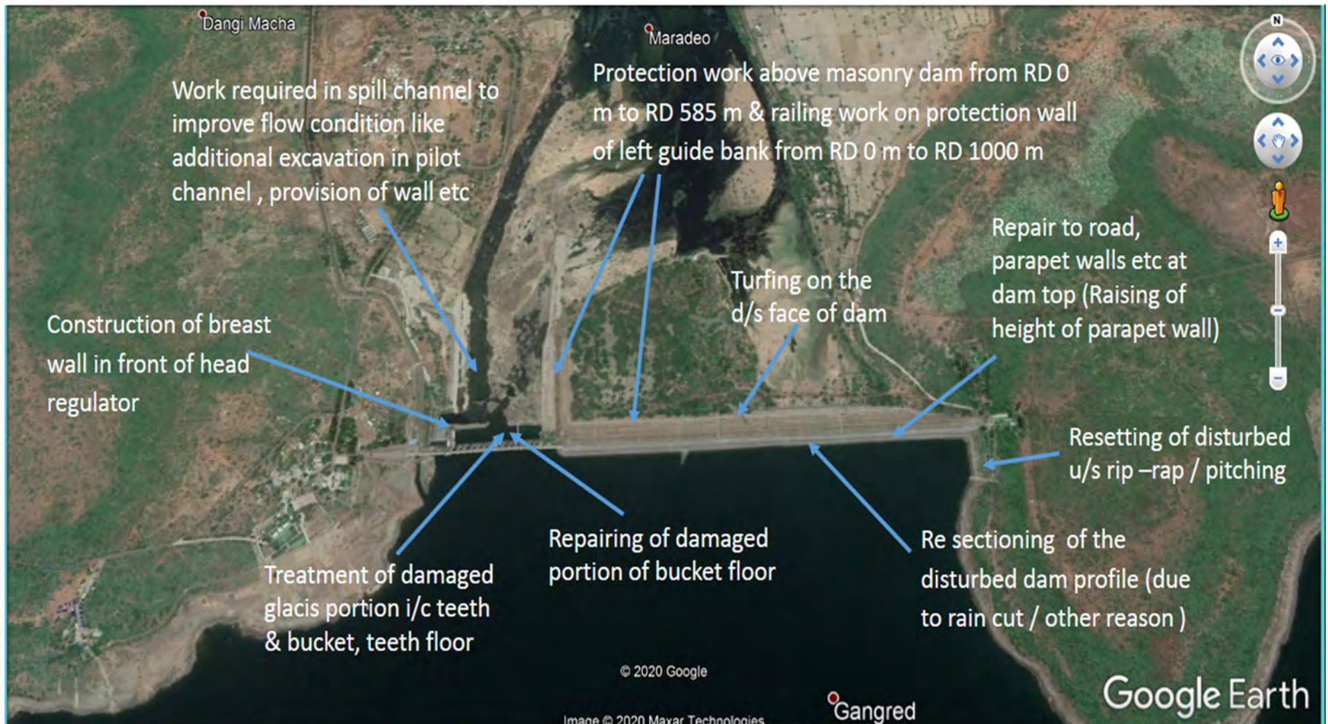
Figure 1.2: Project Area showing major intervention locations