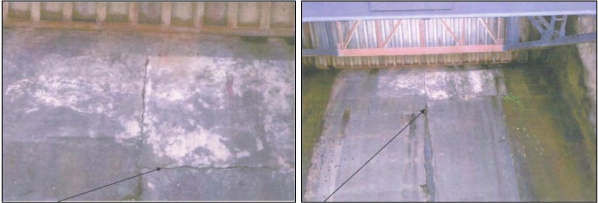
Crack & Leakage seen in Glacis Portion