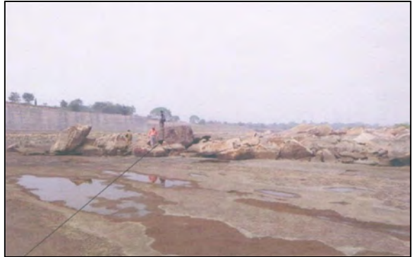
Existing Hard Rock to be cleared in Spill Channel