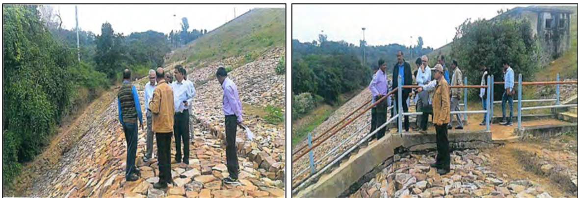
Disturbed u/s rip–rap/ pitching

Figures 1.1 and 1.2 provide photographs of key infrastructure proposed for rehabilitation works and also major interventions locations.