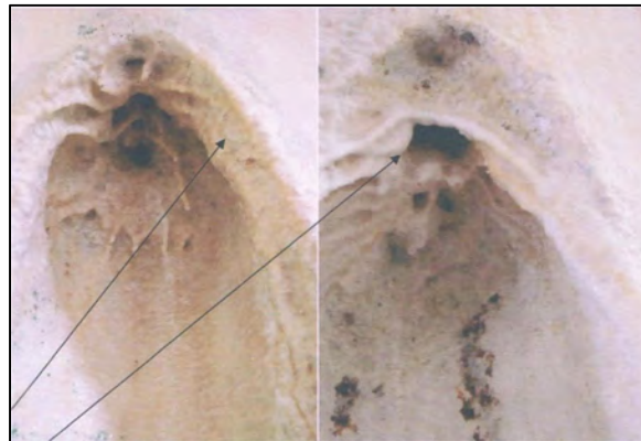
Choked Drain in Gallery